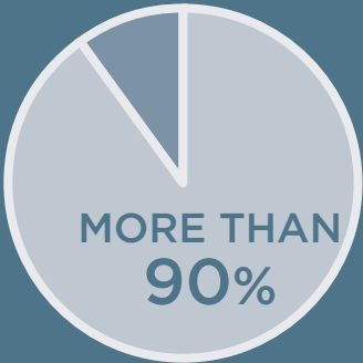
of patients with hep C may be cured. 1,2,5

Medicines for hep C can sometimes cause side effects – headache, diarrhoea or feeling sick. Your healthcare team should be able to suggest things to help ease any discomfort. 1,2,6